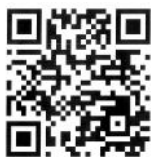
St. John's Giving page QR code

*A big THANK YOU to everyone who donated toward the Christmas gift cards for 73 children from Pearl City School. Women's Gathering will still be collecting through the end of the year. If we collect more than $1825, we will donate the balance to the Food Pantry.