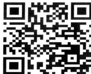
St. John's Giving page QR code